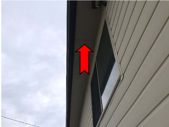
Photo 1. Exterior, throughout, eaves – suspected asbestos-containing fibre cement sheeting.