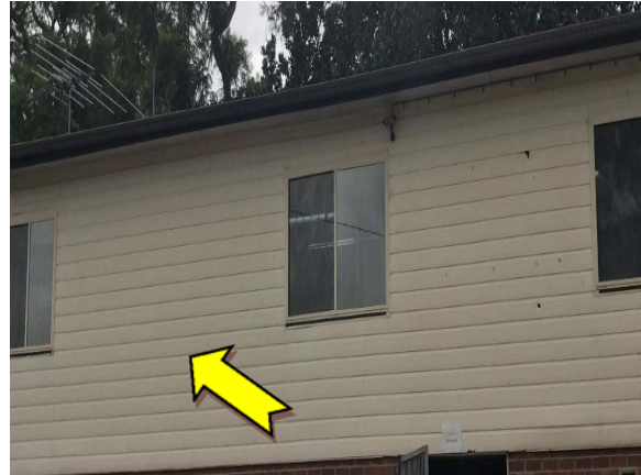
Photo 2. Exterior, throughout, high level, walls - suspected lead-containing cream upper paint system.